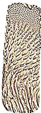
PORTION OF CARVED SUR- FACE OF SCALE. (Mag. four di- ameters.)

magnifying power, a honeycombed appearance. The central and lower parts of the interior surface of the scale ( a ) are in most of the specimens irregularly roughened; while a broad, smooth band, which runs along the top and sides, and seems to have furnished the line of attachment to the creature's body, is comparatively smooth. The exterior carvings, though they demand the assistance of the lens to see them aright, are of singular elegance and beauty; as perhaps the accompanying woodcut, (fig. 26,) which gives a magnified view of a portion of the scale immediately above ( b ) from the middle of the honeycombed field on the right side, to where the anastomosing ridges