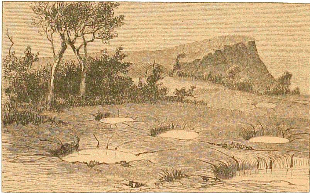
FIG. 127.—CIRCULAR CAVITIES AT ROSARNO (CALABRIA).

A strange phenomenon, which occurred in many parts of Calabria, was especially noticed, according to the report of the Academy of Naples, in the outskirts of Rosarno. Across the whole extent of the surrounding plain opened numerous circular cavities (Figs. 127, 128), of about the size of a carriage-wheel. Some of these cavities—