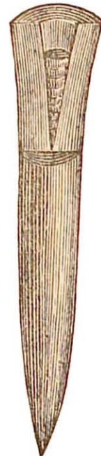
BELEMNITES SULCATUS. ( Oolite. )