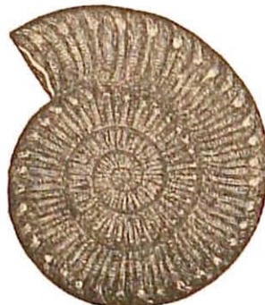
A. BISULCATUS. ( Lias. )