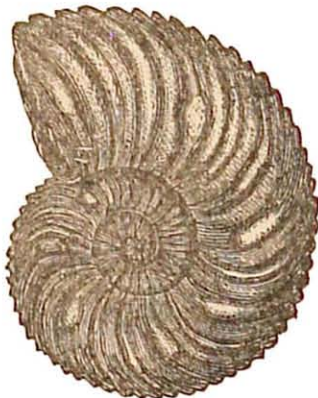
A. MARGARITATUS. ( Lias. )