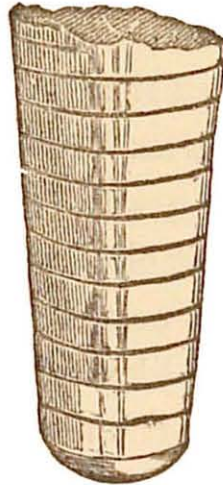
ORTHO CERAS LATERALE. ( Mountain Limestone. )