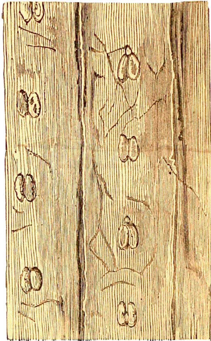
Fig. 65.— Sigillaria reniformis .

On the left are seen the naked trunk of a Lepidodendron and a Sigillaria , an arborescent Fern rising between the two trunks. At the foot of these great trees an herbaceous Fern and a Stigmaria appear, whose long ramification of roots, provided with