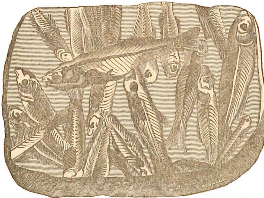
LEBIAS CEPHALOTES. Cycloids of Aix. ( Miocene. )