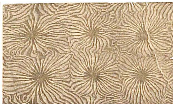
SMITHIA PENGELLYI. (Old Red Sandstone.)

which so smit the dames of England, that each had to provide herself with a gown of the fabric which they adorned, had been stamped amid the rocks eons of ages before. And it must not be forgotten, that all these forms and shades of beauty which once filled all nature, but of which only a few fragments, or a few faded tints, survive, were created, not to gratify man's love of the æsthetic, seeing that man had no existence until long after they had disappeared, but in meet harmony with the tastes and faculties of the Divine Worker, who had in his wisdom produced them all.