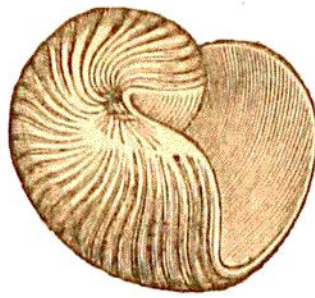
Fig. 54.— Bellerophon costatus . Half nat. size.