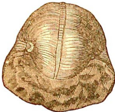
Fig. 56.— Bellerophon hiulcus .