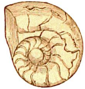
Fig. 55.— Goniatites evolutus . Nat. size.