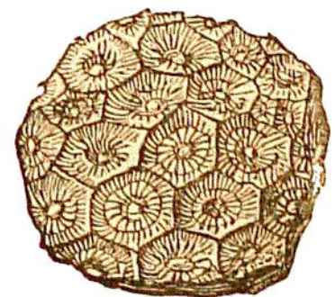
Fig. 59. Lonsdalea floriformis .

rock, began to make their appearance in the period which now engages our attention.