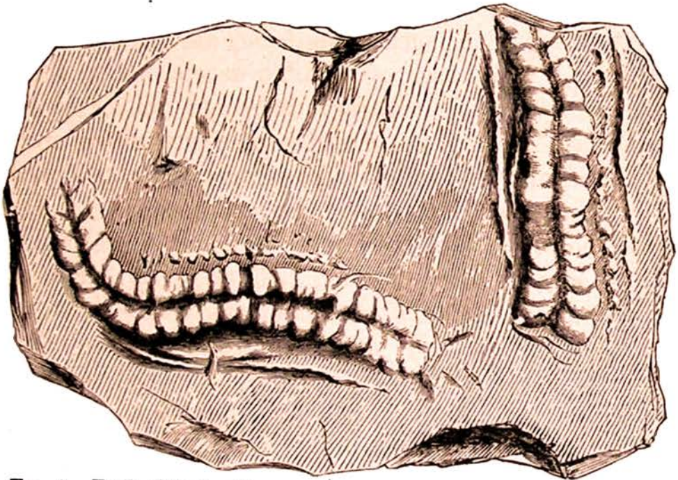
FIG. 6.—Trail of Carboniferous crustacean ( Rusichnites Acadicus ), Nova Scotia, to illustrate supposed Algae.

nary feet, and the central furrow by the tail. It was also shown that when the Limulus uses its swimming-feet it produces impressions of the character of those named