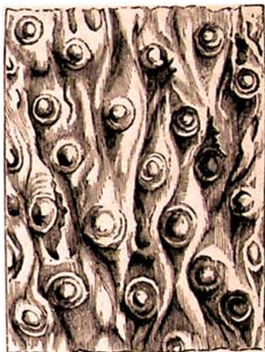
FIG. 39.—Portion of bark of Stigmaria , showing scars of attachment of rootlets.